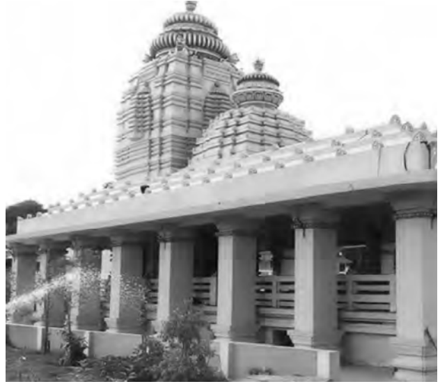
Govardhana Pitha, Puri

My child, suppose some robbers have blindfolded a man and removed him from his home in the Gandhara region, and have left him in a desolate place. And suppose he shouts in all directions: 'I have been brought here and left blindfolded; I have been brought here and left blindfolded.' Again, suppose someone comes and removes his blindfold and tells him, 'The