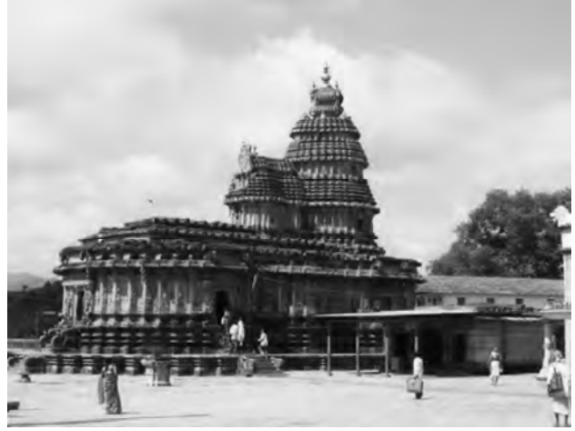
Shringeri Pitha, Karnataka

The position of the traditional Advaitic school of Acharya Shankara is well known and often summarised in the famous 'half verse': 'Brahman alone is real, the one absolute reality, brahma satyam ; the world is unreal, false, or insubstantial, jagat mithya ; and the individual soul is none other than Brahman, jivah brahma eva na aparah .' 5 The mahavakyas , at least the first three mentioned above, speak directly to the oneness of the individual soul and the supreme Soul,