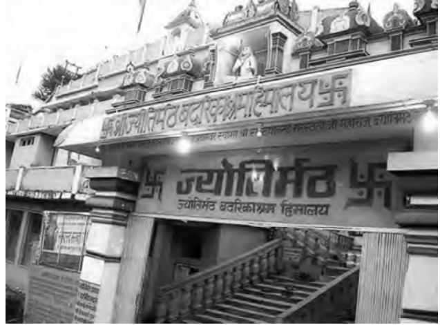
Jyotirmatha Pitha, Uttarakhand

Then Shvetaketu replies: 'This is something new. Surely, my teachers did not know this. Otherwise they would have taught it to me. Please explain further' (6.1.7). Then Uddalaka explains the nature of creation, which is in reality nothing but Brahman manifesting as the visible universe, through a process of evolution of the elements. 'In the beginning there was nothing