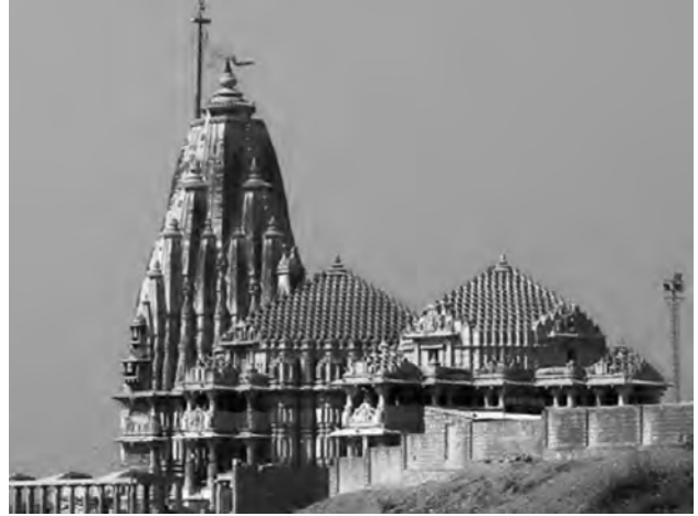
Dwaraka Pitha, Gujarat

This verse is then followed by nearly twenty pages of commentary by Acharya Shankara,